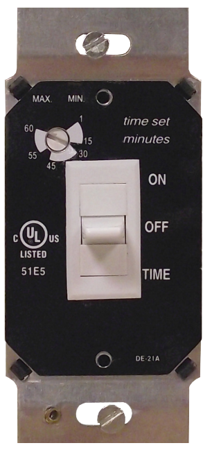
#42507 - White Shown