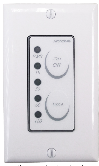
Shown with White Overlay and Decorator Wallplate