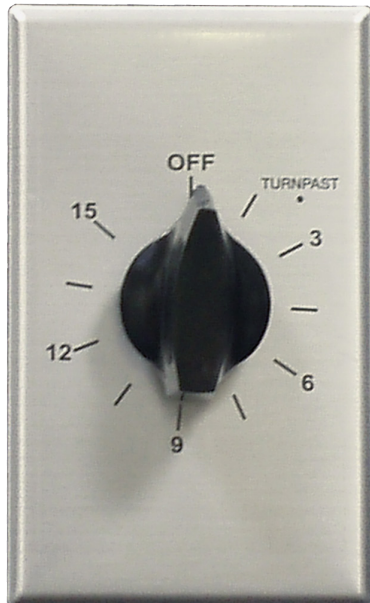
# 93301 - 15 Minute Timer Shown